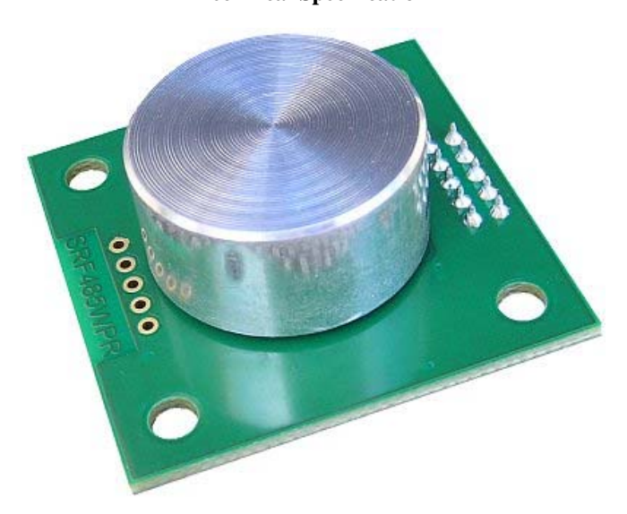
Note - This sonar has a waterproof transducer, not an underwater transducer. It is designed for operation in air.